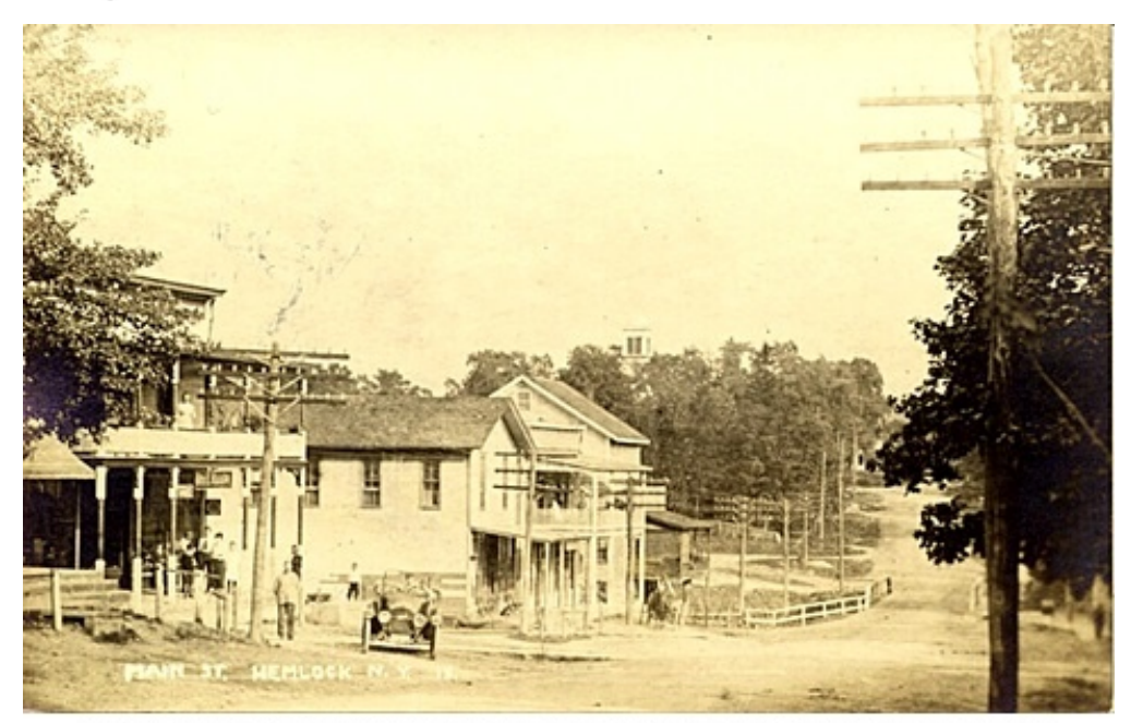
Woodruff Block on Main street in Hemlock NY after reconstruction in 1908, the Knapp Store is on the left. A fire destroyed the building known as the Woodruff Block on 1 February 1908. The building was built in 1898 by E. B. Woodruff and J. P. Coykendall.