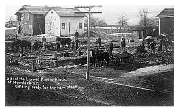
The burned Knapp store on Main street in Hemlock NY 1908. The fire that destroyed the Woodruff Block on 1 February 1908. The building was built in 1898 by E. B. Woodruff and J. P. Coykendall.

We wish to say right on the start that the people of Livonia are very sorry indeed for the hard luck that their sister village has sustained. The same thing is liable to come to Livonia any day or night, but we hope the evil day will not draw nigh for a long time.