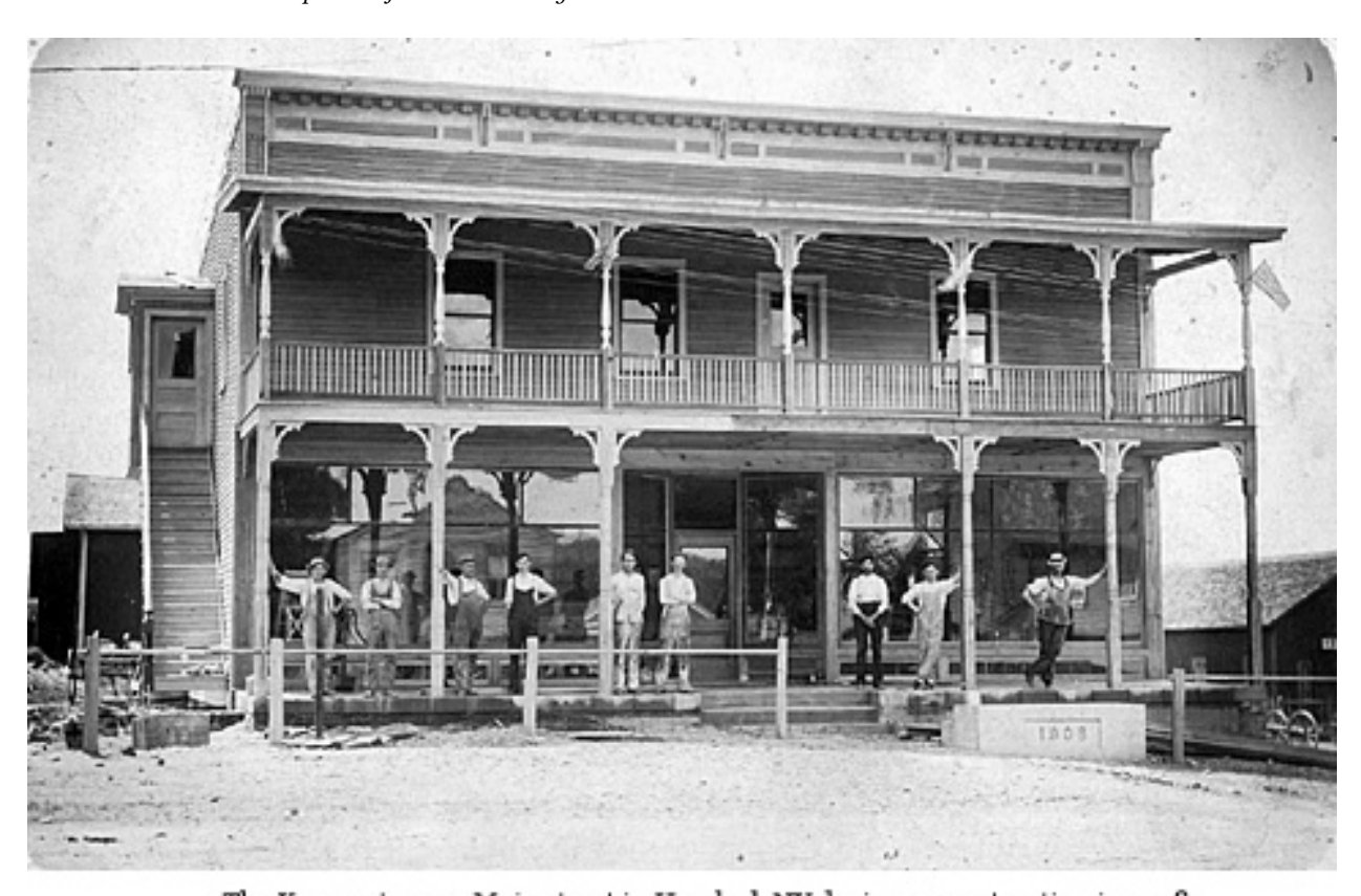
The Knapp store on Main street in Hemlock NY during reconstruction in 1908. A fire destroyed the building known as the Woodruff Block on 1 February 1908. The building was built in 1898 by E. B. Woodruff and J. P. Coykendall.

Editor's Note: After the fire of 1 February 1908 the commercial section of Main street in Hemlock NY known as the Woodruff Block was rebuilt. Here are some photos of the new building.